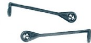
Composè 2 per completi Modello a Bastoncino