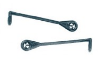
Composè 2 per completi Modello a Bastoncino