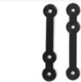
Composè 3 per completi Modello a Fettuccia