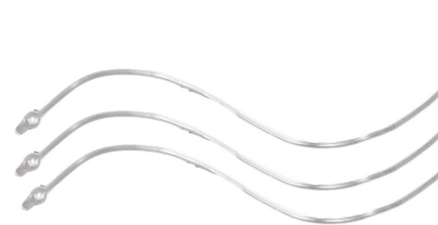
PVC string for trousers bar