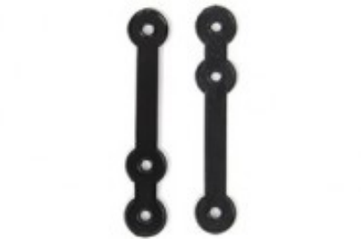
Composè 3 per completi Modello a Fettuccia