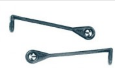
Composè 2 per completi Modello a Bastoncino