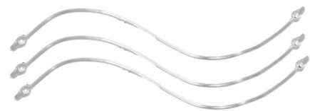
PVC string for trousers bar