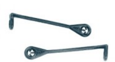
Composè 2 per completi Modello a Bastoncino