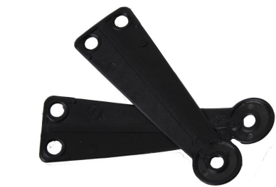
Composè 1 per completi Modello a Triangolo