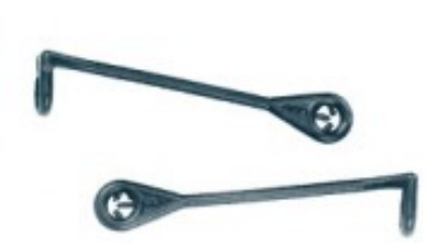
Composè 2 per completi Modello a Bastoncino