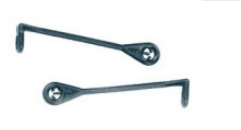
Composè 2 per completi Modello a Bastoncino