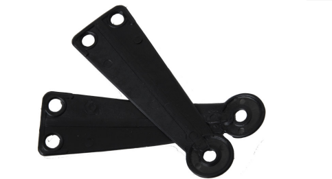
Composè 1 per completi Modello a Triangolo