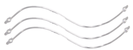
PVC string for trousers bar