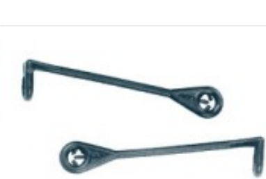
Composè 2 per completi Modello a Bastoncino