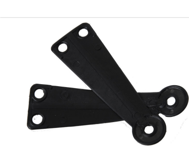
Composè 1 per completi Modello a Triangolo