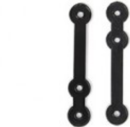
Composè 3 per completi Modello a Fettuccia