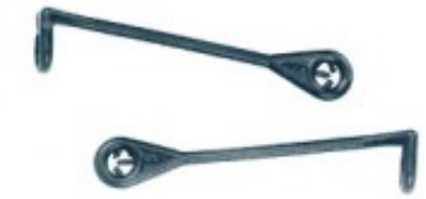
Composè 2 per completi Modello a Bastoncino